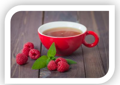
Red raspberry leaf tea can help with cramps.