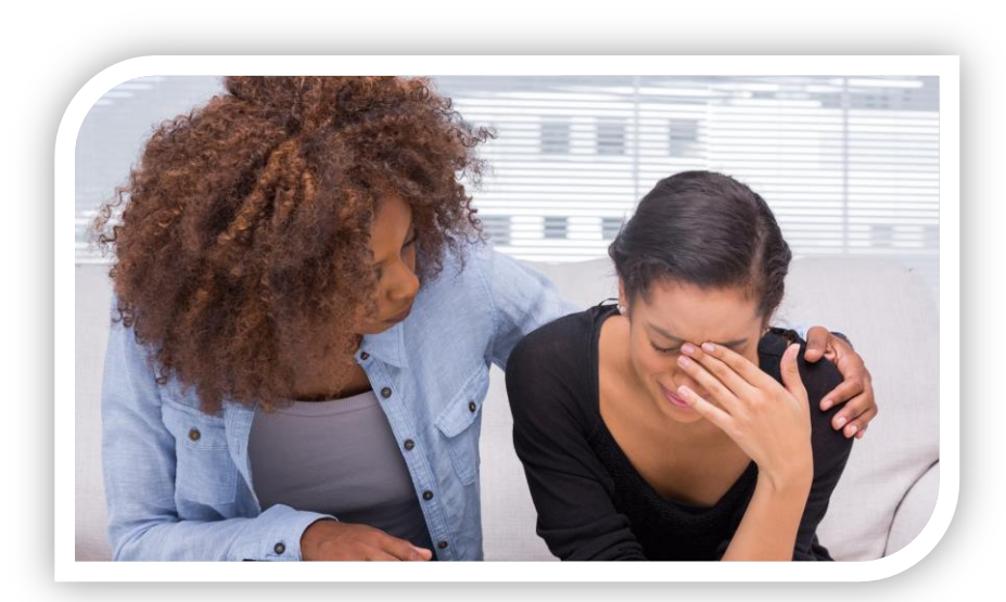
If you're feeling sad, talk to family and friends.

About 3 out of every 4 women get baby blues.