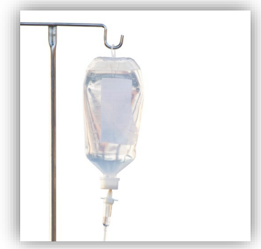
You will get oxytocin through your IV fluid.