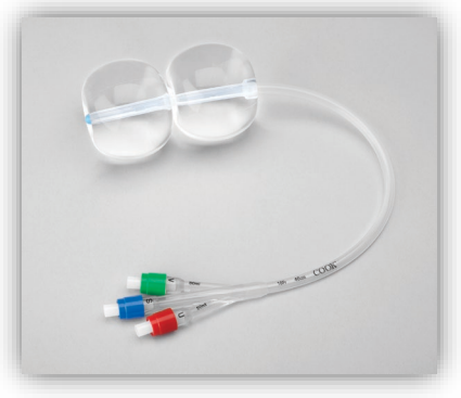
Cervical Ripening Balloon or Cook Catheter

Oxytocin is the same hormone in your body that makes the uterus contract. This medicine will make your contractions stronger and closer together. The contractions can be more painful. You will get this medicine through your IV fluid. The fluid will go directly into your vein. Oxytocin is given slowly and it may take many hours before you go into active labor.